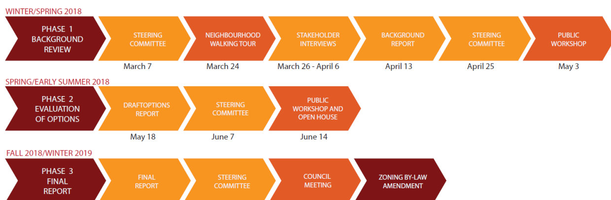
Table 1: Glen Williams Mature Neighbourhood Study Phases

The Study is being undertaken in three phases. These are illustrated in Table 1 below.