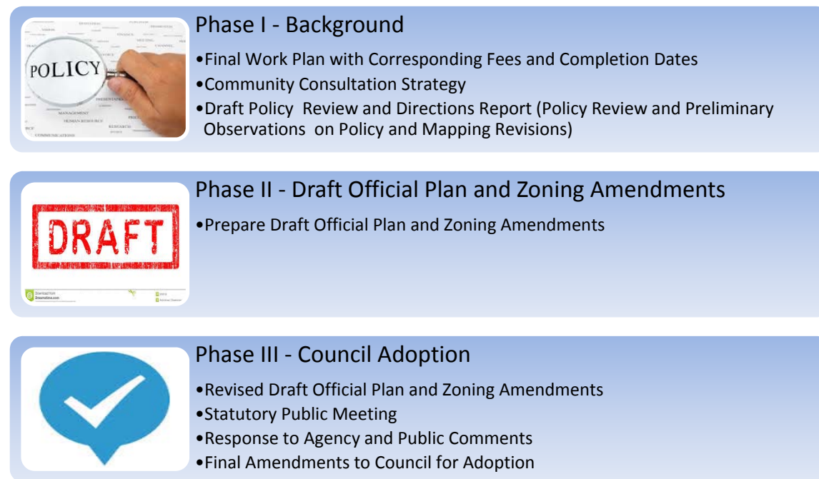
Figure 1: Three Phase Planning Process

Regional policies and initial observations of where policy and mapping amendments may be necessary to the Town of Halton Hills Official Plan and Zoning By-law.