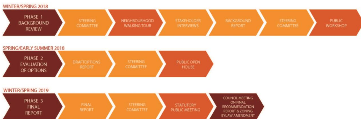
Figure 1: Glen Williams Mature Neighbourhoods Study Timeline

Phase 1: Background Review included background research, stakeholder interviews, and the walking tour to obtain an understanding of the neighbourhood characteristics valued by Glen residents. A Background Report (April 2018) was prepared outlining the findings of the Phase 1 work, and this information was presented at May 3 rd public workshop. The workshop included active participation of attendees to discuss and evaluate various potential tools and options for regulating large home rebuilds in a manner that would protect mature neighbourhood character.